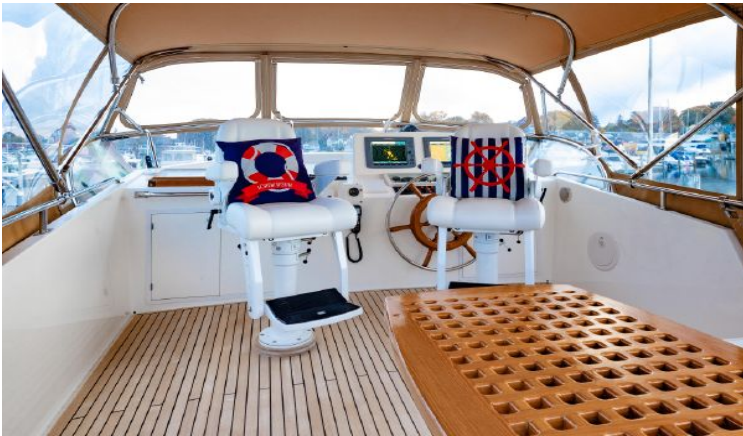
Spacious Flybridge w/Twin Stidd 'Admirals'