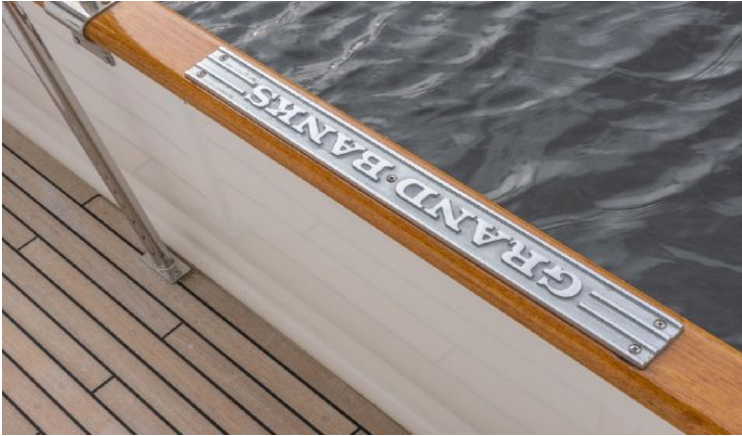
GB Step Plate, Port and Starboard