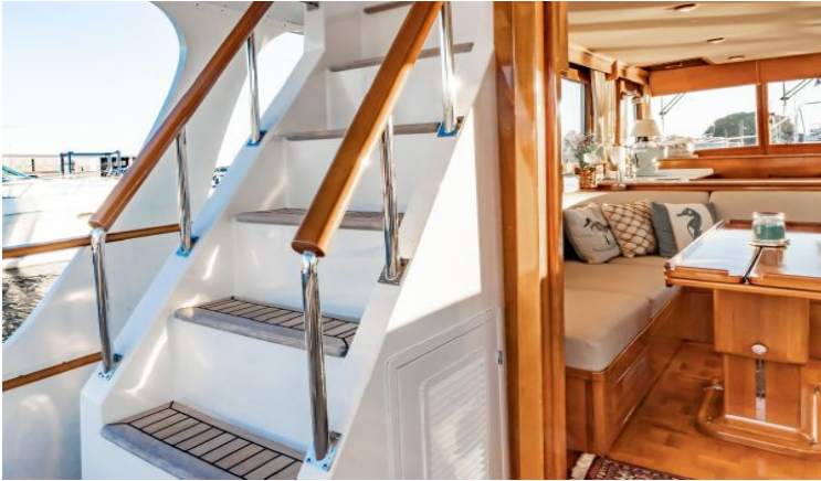
Safe, easy, Stairs to FB