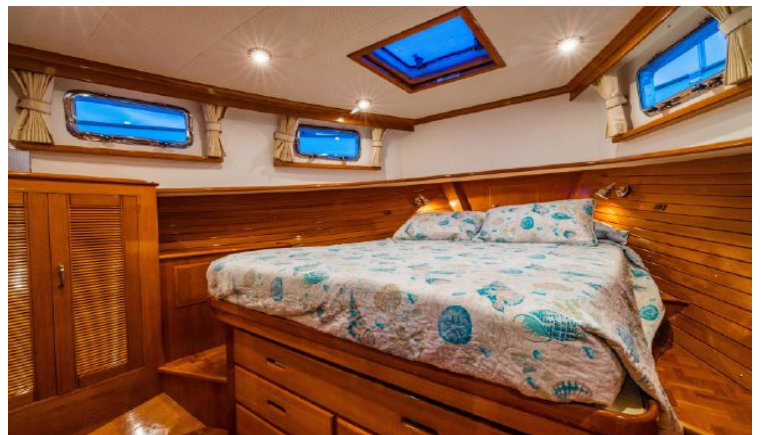
Queen Island Berth