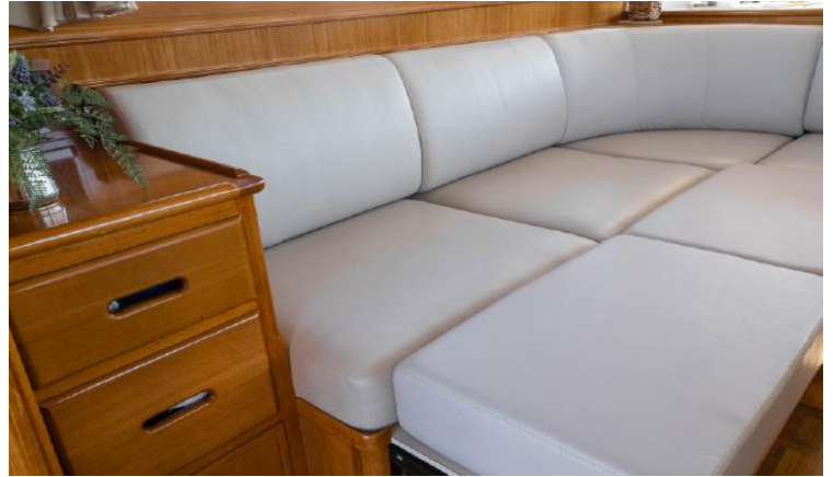
Port Settee pulls out to make a Double Berth