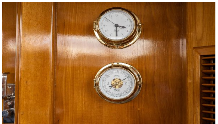
Ships Chronometer and Barometer