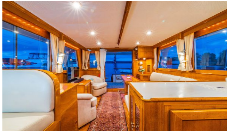
Salon Looking Aft, Helm Double Bench Seat