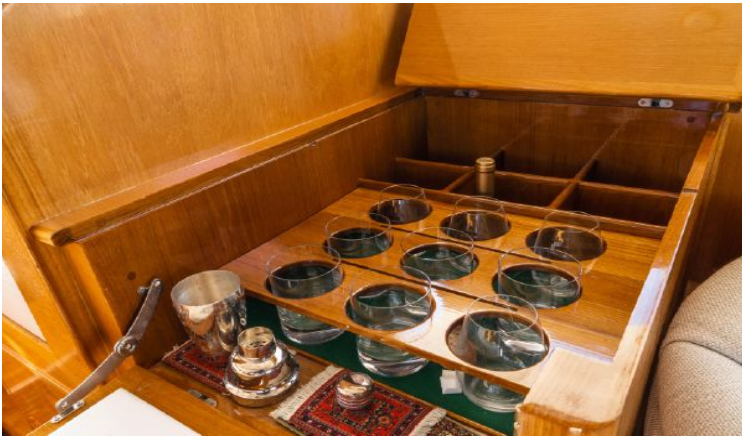
Grand Banks Cocktail Cabinet