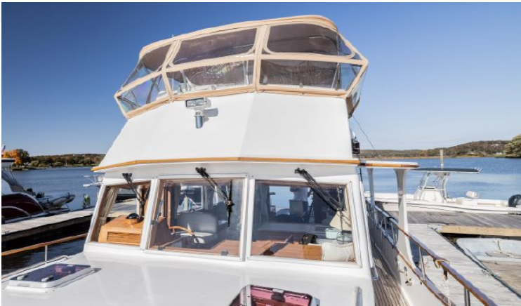
Windshield and FB Enclosure