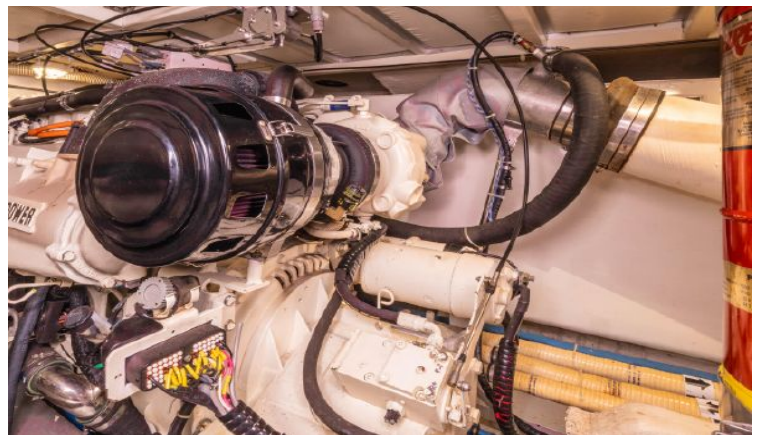
Air Intake, Turbo and Exhaust