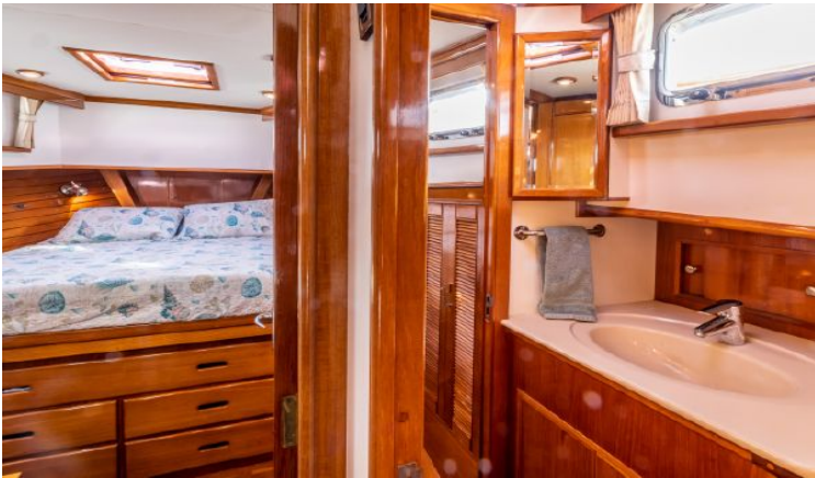
Head and Master