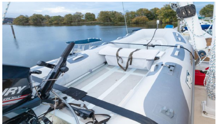
New Tender and O/B