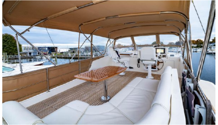
Large FB Settee and Table