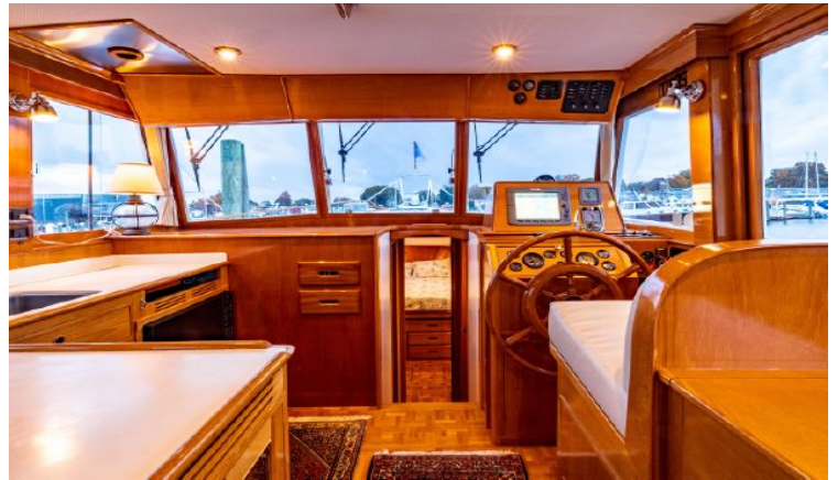
Gally and Lower Helm, Cook Top Down