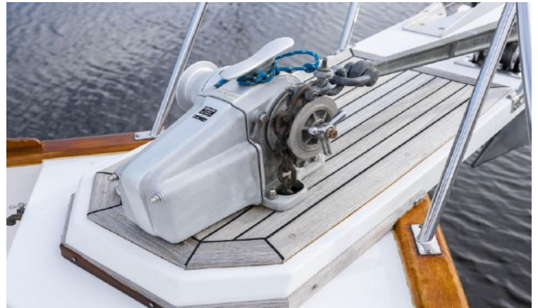
Pulpit, Double Rollers and Windlass