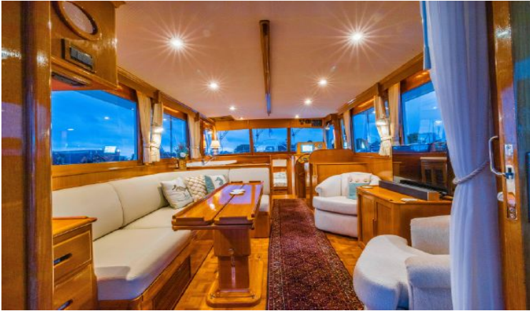
Sumptuous Salon looking Forward