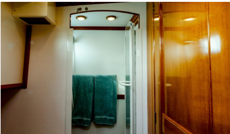
Large Enclosed Shower