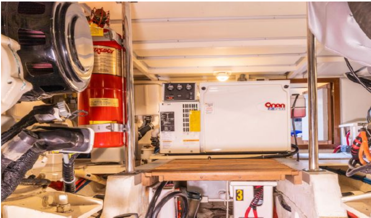
Looking Aft to Onan Genset