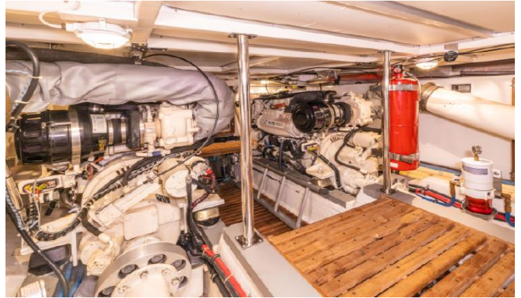
Twin 440hp CATs