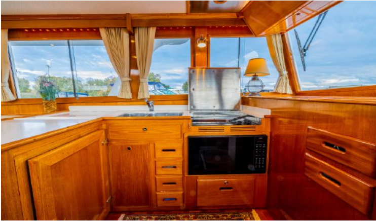
Galley, with Cook Top Cover Up