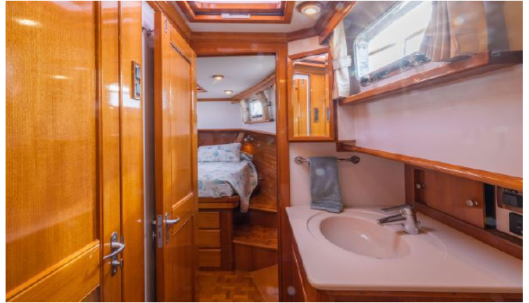
En Suite Head to Master