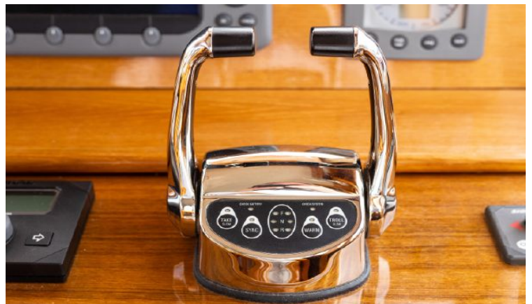
Upgrade to Glendinning Engines Controls