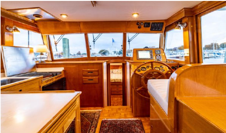
Galley and Lower Helm