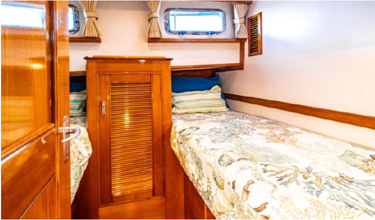
Delightful Twin, w/8 drawers, plus Hanging Locker