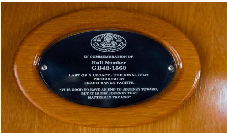
Proud Medaillon - The Last GB42, #1560