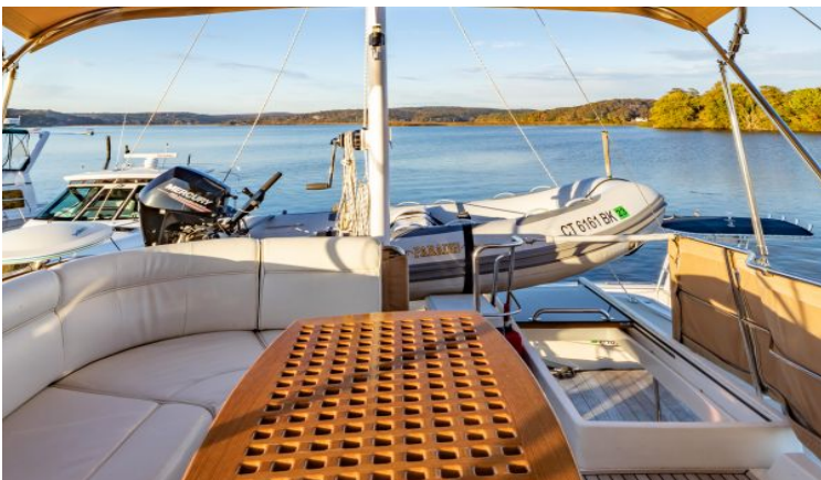
Boom and Tender