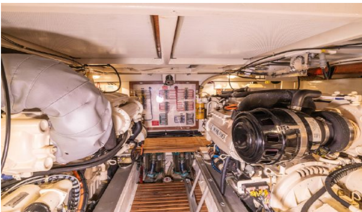
Looking towards Forward Bulkhead