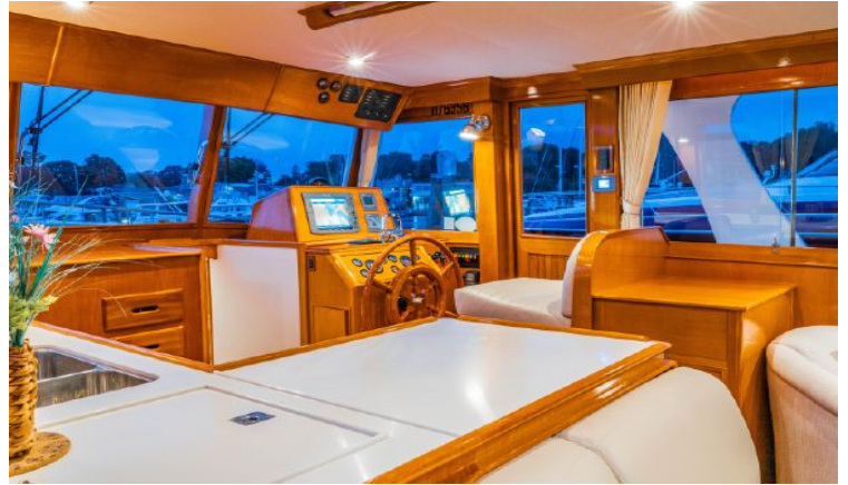
Top Load Freezer and Cocktail Cabinet