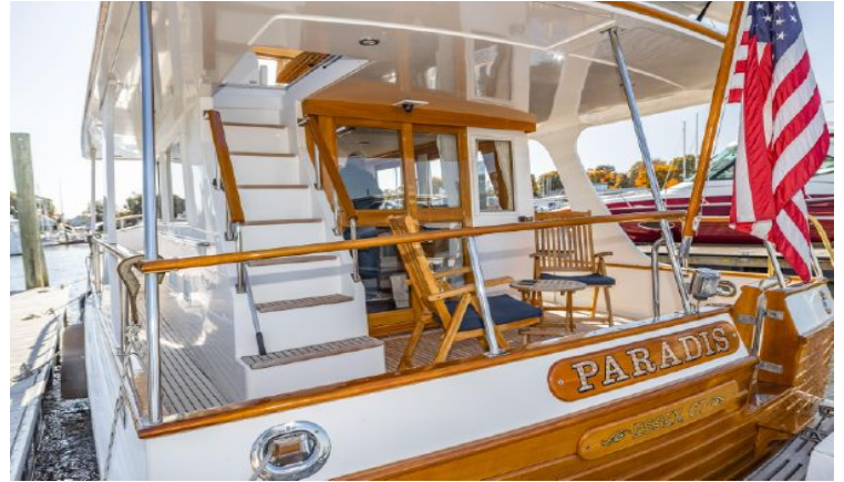
Spacious Enclosed Cockpit w/Transom Door