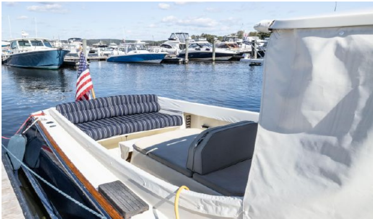
Custom Covers on Coaming and Table