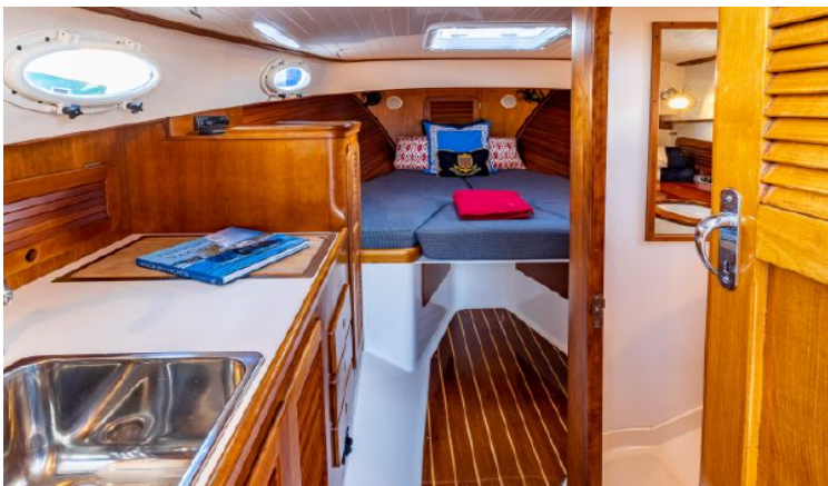
Beautifully Crafted Accommodations