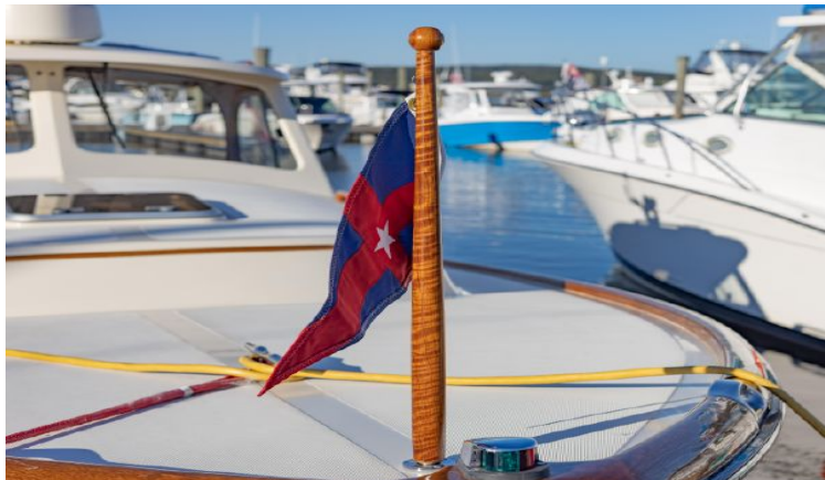
Burgee and Staff