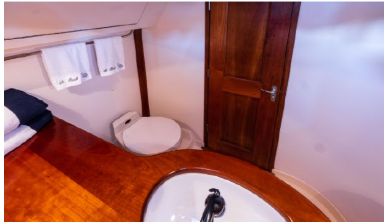
Head with Varnished Wooden Counter