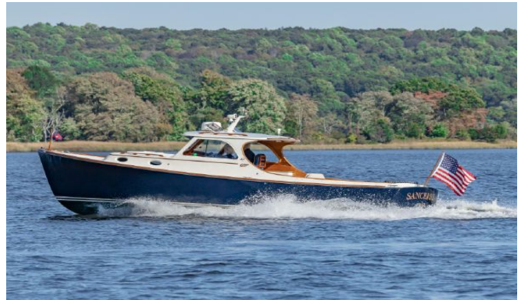
At 25 Knots