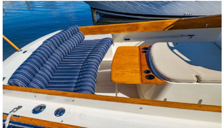
Aft Table Extended