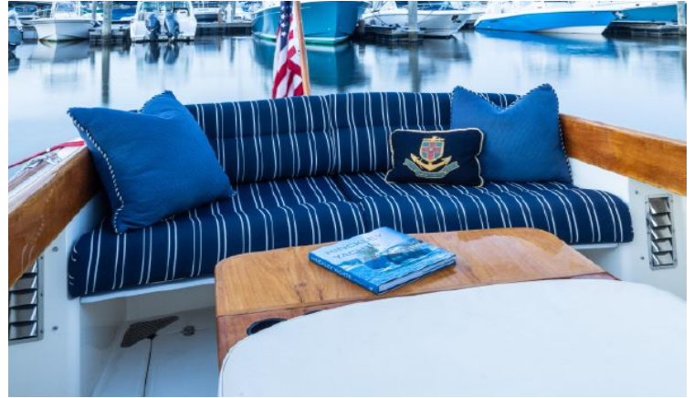
Luxurious Aft Settee