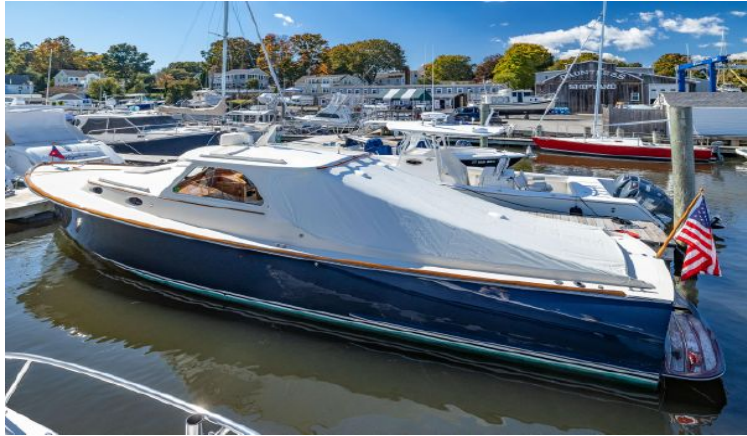
New Stamoid Mooring Cover