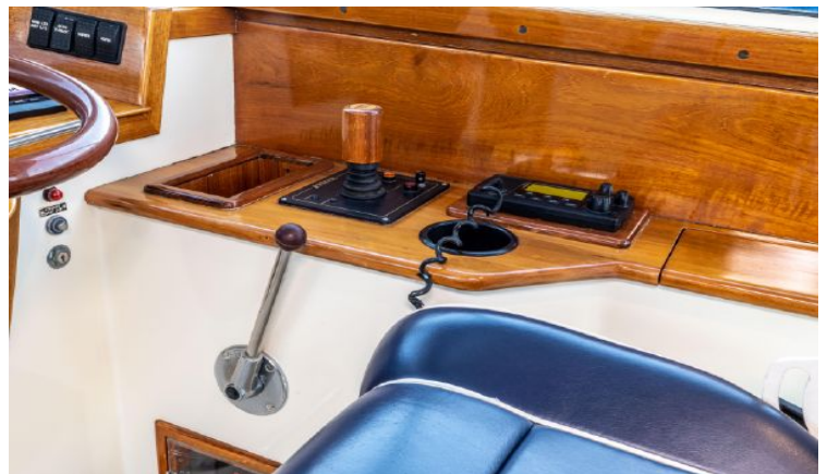
Hinckley "JetStick®" upgraded Gen-2 system