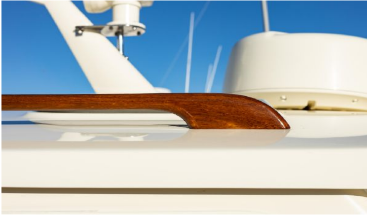
Newly refinished Brightwork, Roof and Mast