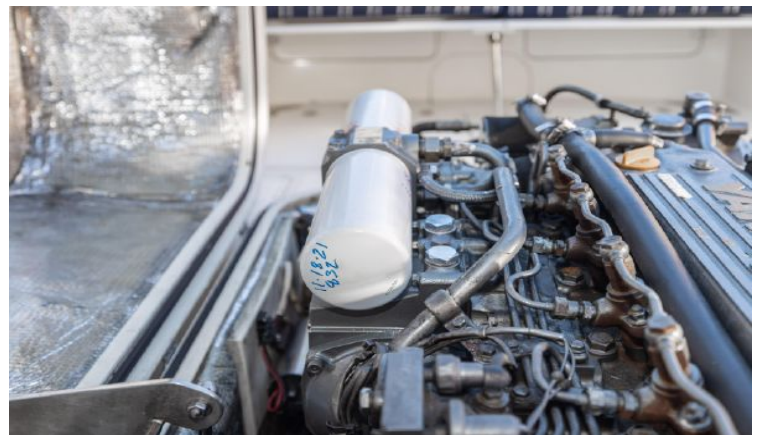
Excellent Engine Access