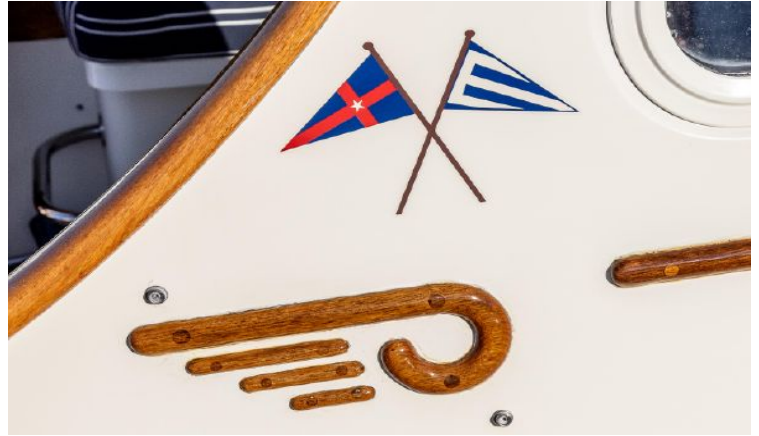
Proud Crossed Burgees and Hinckley Logo