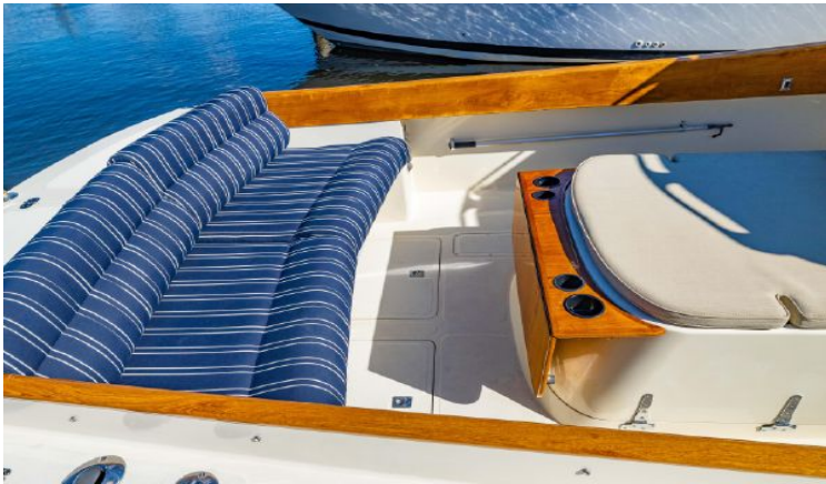
Aft Table Folded Down