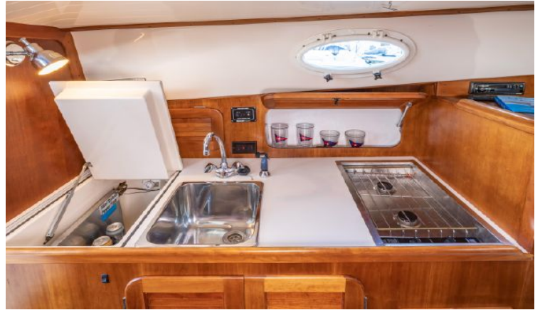
Galley with Fridge and Cooktop Open