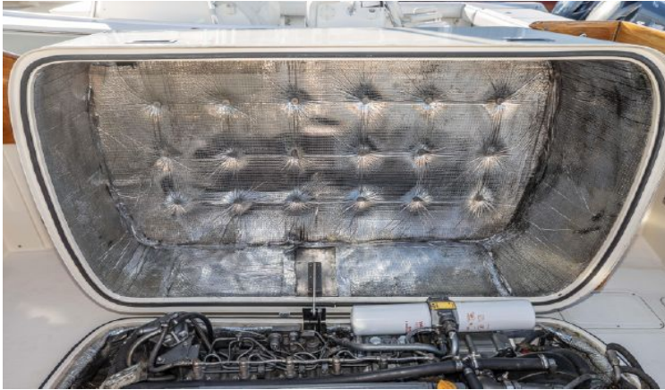
Heavy Lead-Lined Sound Attenuation