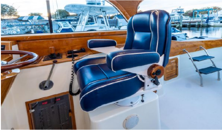
Stidd Helm Seat in Rich Blue