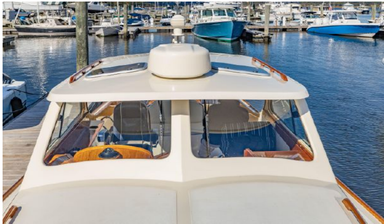
House with Covers Off