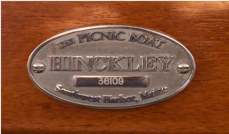
Proud Hinckley Medallion