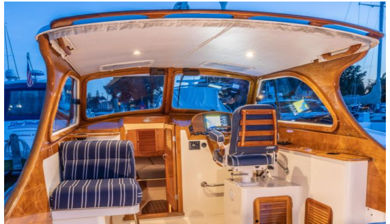
Helm Deck with Forward and Aft Facing Seats