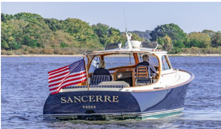
Hinckley Signature Tumblehome