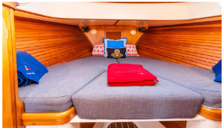
Forward Berth with Filler