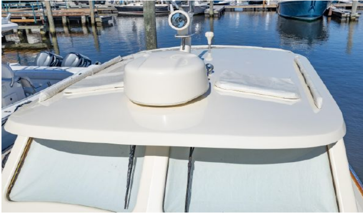
House with Full Matching Stamoid Covers