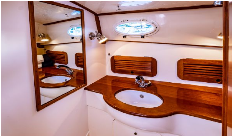
Well Appointed Head w/Large Mirror