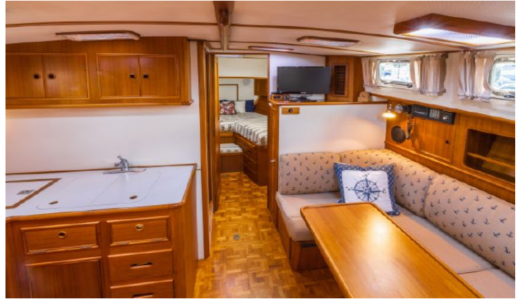
Entering Comfortable Accommodations Below