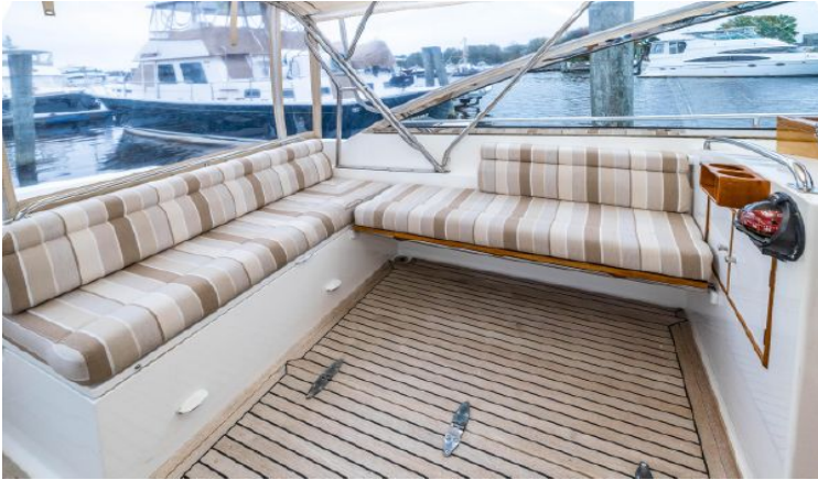
Extensive Helmdeck Seating