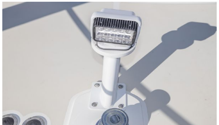
Remote-Control LED searchlight