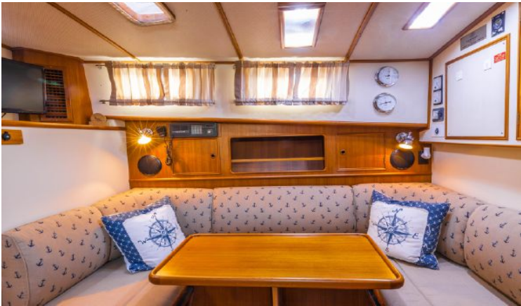
Dinette w/Hi-Lo Table, Converts to Berth