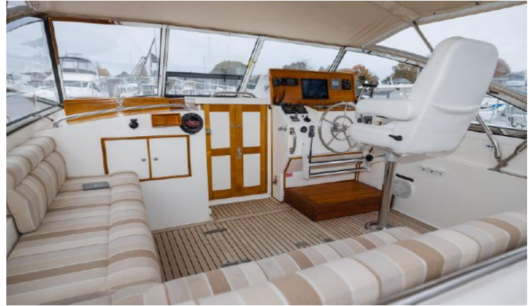
New Captain's Seat and Foot Rest