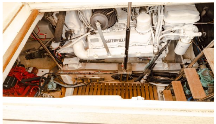
Clean CAT 3208TA (Port) Engine