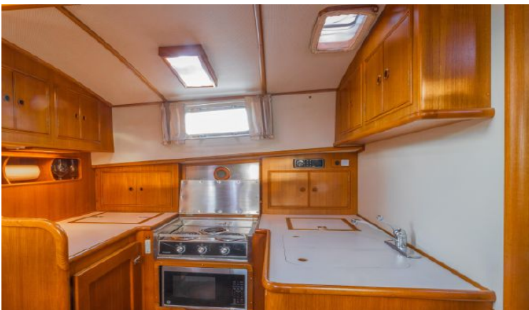
Beautifully Fitted Galley