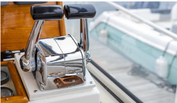
Upgraded Engine Controls