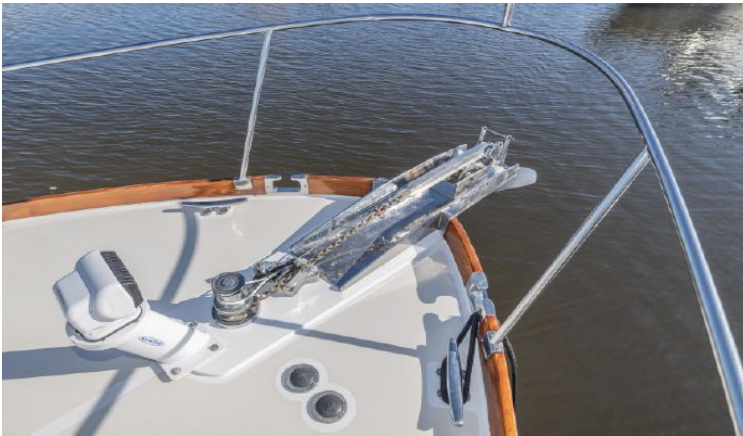
Anchor and Windlass