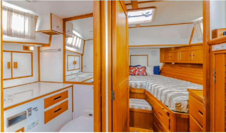
Forward Berth and Adjacent Head