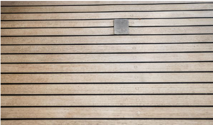
Excellent Teak Decks