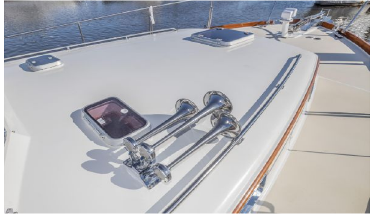
Triple Kahlenberg Air Horns