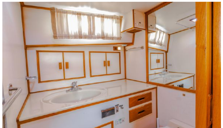
Bright, Fresh, Head, Large Vanity