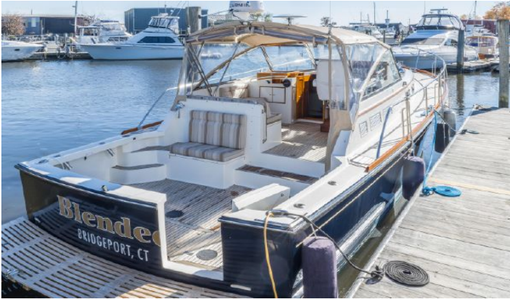
Spacious Aft Cockpit - Step Aboard