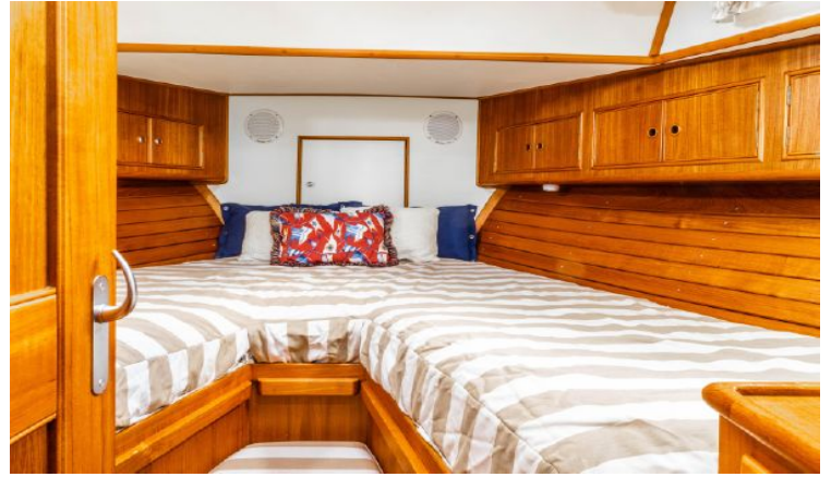
Vee Berth (Has Filler)