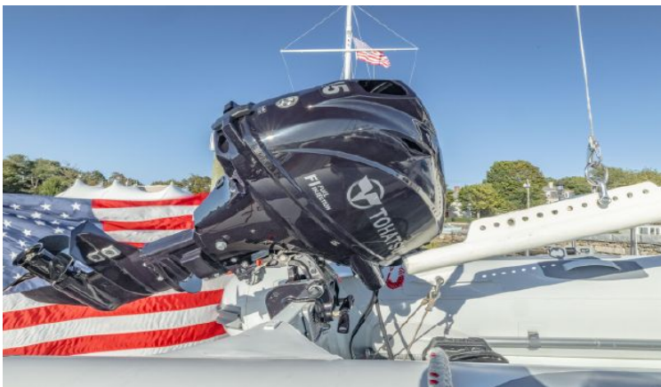
New Tohatsu 15 HP O/B, Fuel Inj. & Electric Start