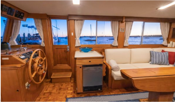
Lower Helm, Cocktail Cabinet and Icemaker