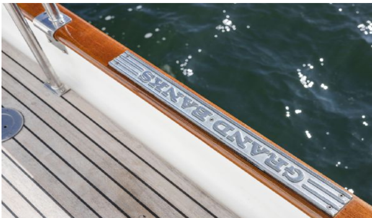
Welcome Aboard! Trusted Grand Banks Heritage