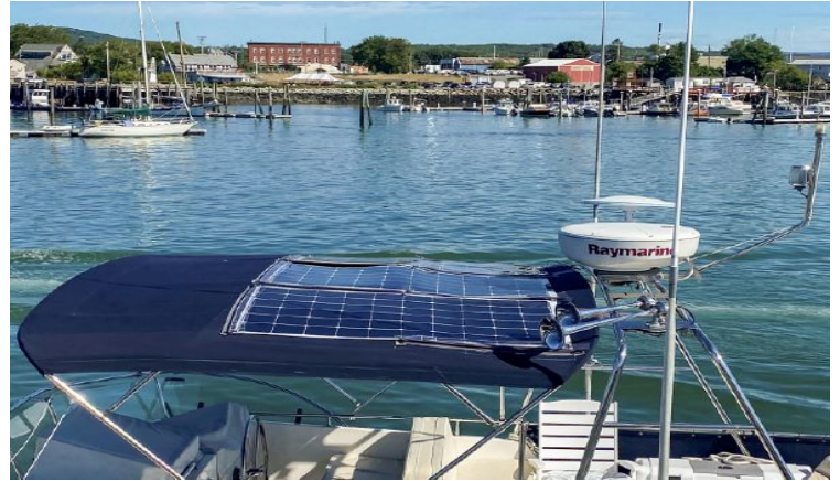
Solar Array and Radar Arch