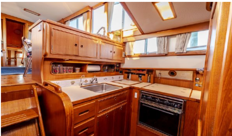
Bright and Airy Galley w/Extensive Counter