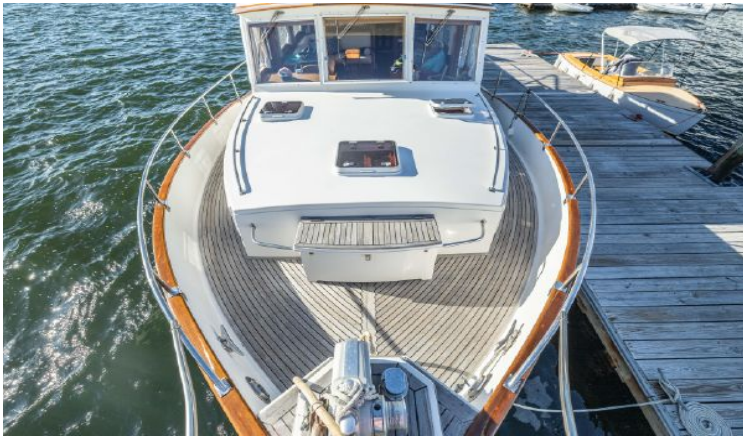
Great Decks, Windlass, Line Locker/Seat