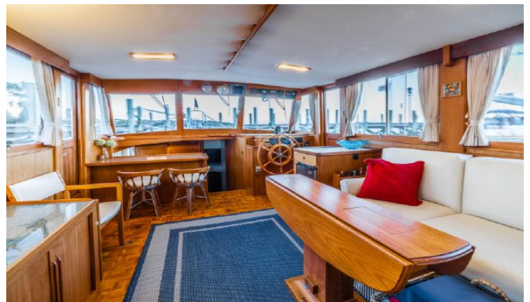
Gracious Salon with Two Side Doors