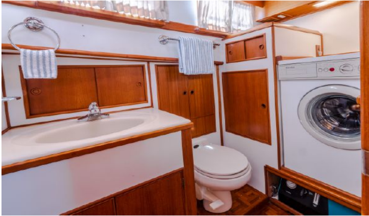
Spacious Guest/Day Head and Laundry