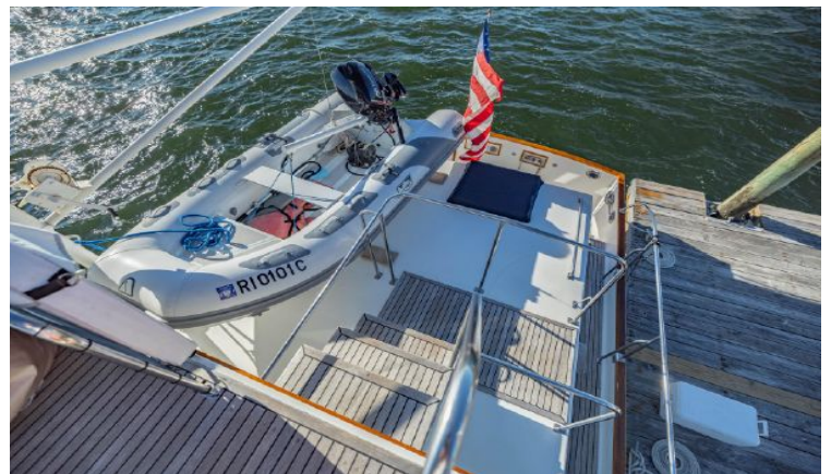
Safe Access to Flybridge - No Ladders!