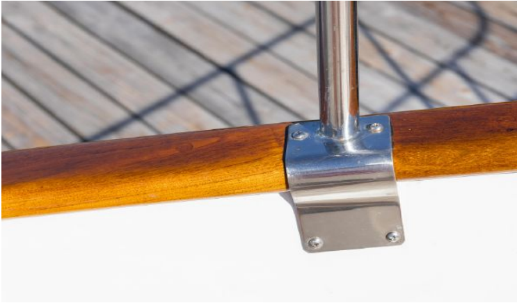
Perfect New Brightwork