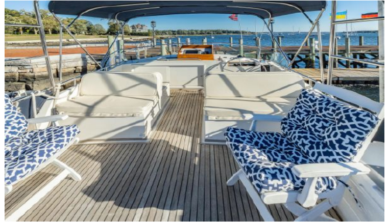
Spacious Flybridge Seating for 10