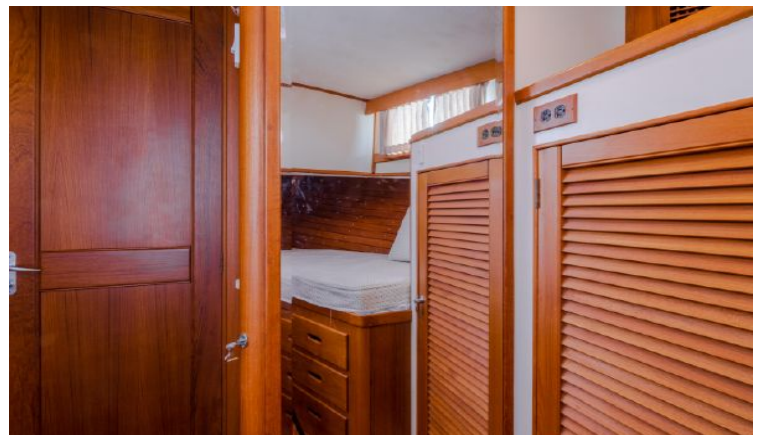
Guest Suite, Full Length Mirror and Hanging Locker