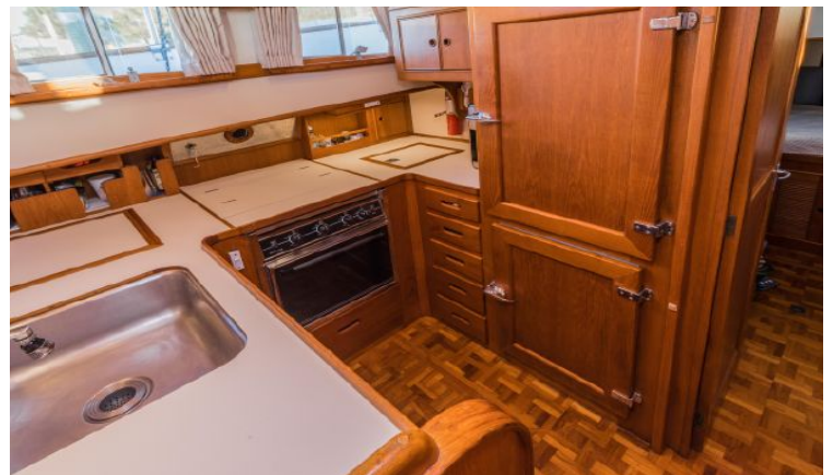
Large U-Shaped Galley w/Refrigerator and Freezer