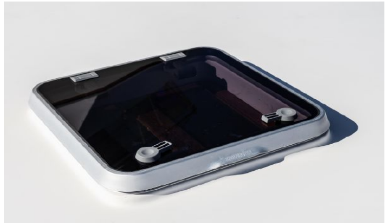
All New Lewmar Hatches on Foredeck