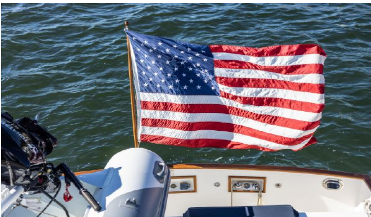
Fine View Aft from Flybridge