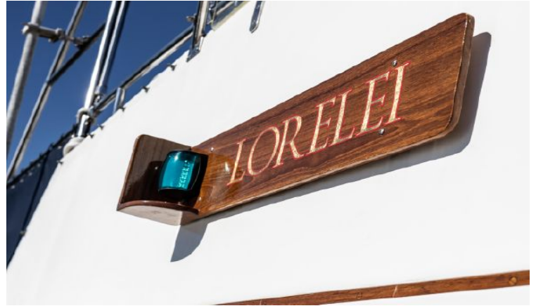
Classic Name Board