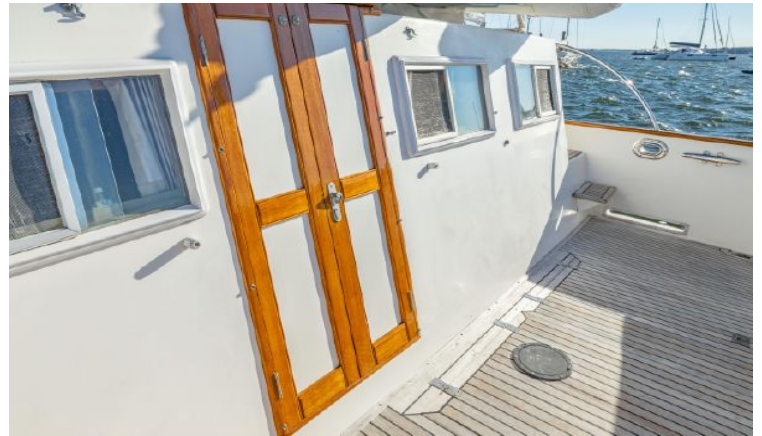
Gorgeous Aft Doors from Master Suite