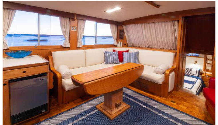
Fold-Out Hi-Low Table, Settee w/Storage Under