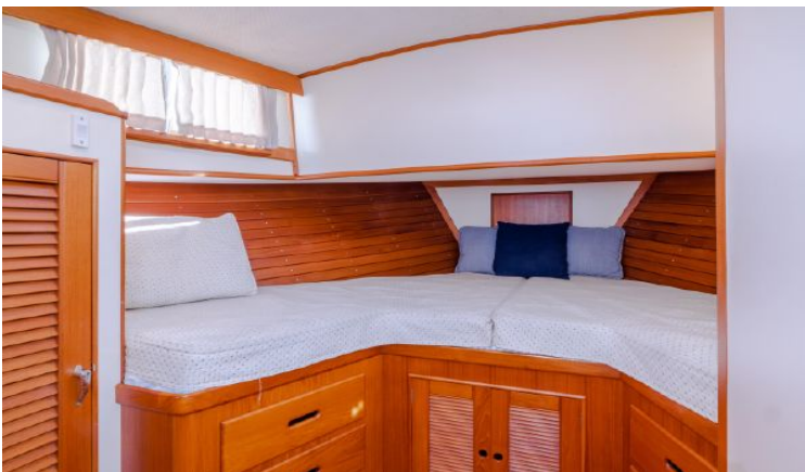
Forward Guest Suite