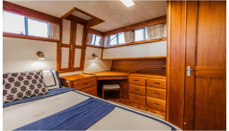
Corner Desk or Dressing Table