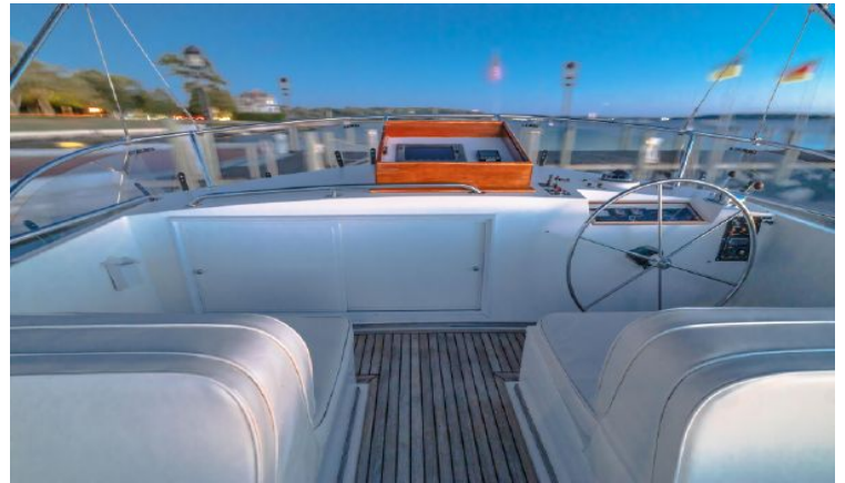
Upper Helm at Dusk