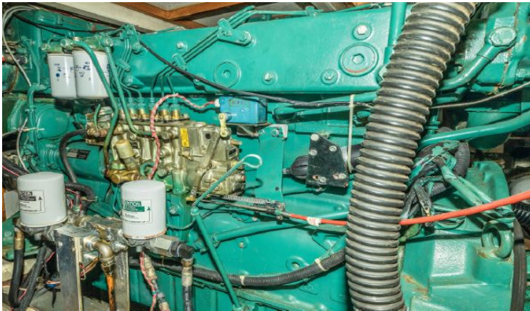
Dependable Volvo Penta TAMD 102D