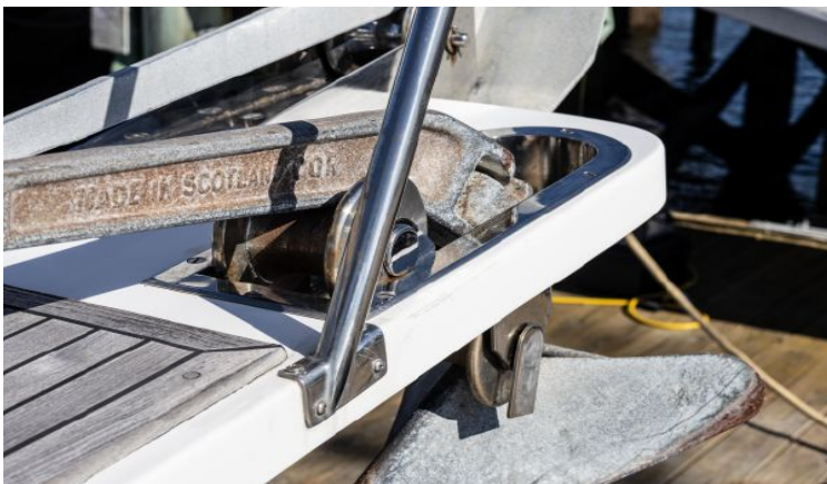
Main Anchor, "Made in Scotland"