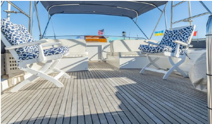
Excellent Upper Deck