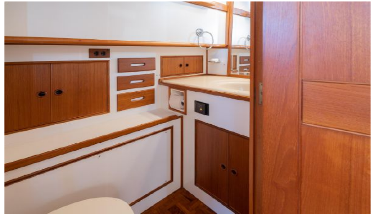
Luxury Master Head