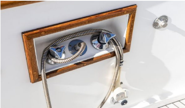
Hot and Cold Cockpit Shower