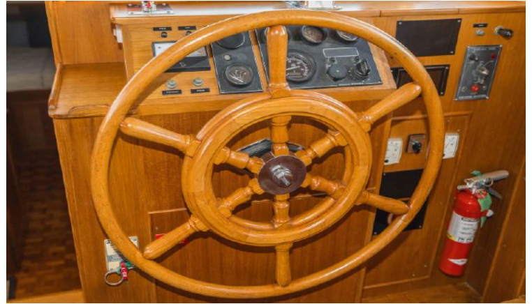
Edson Wheel at Lower Helm