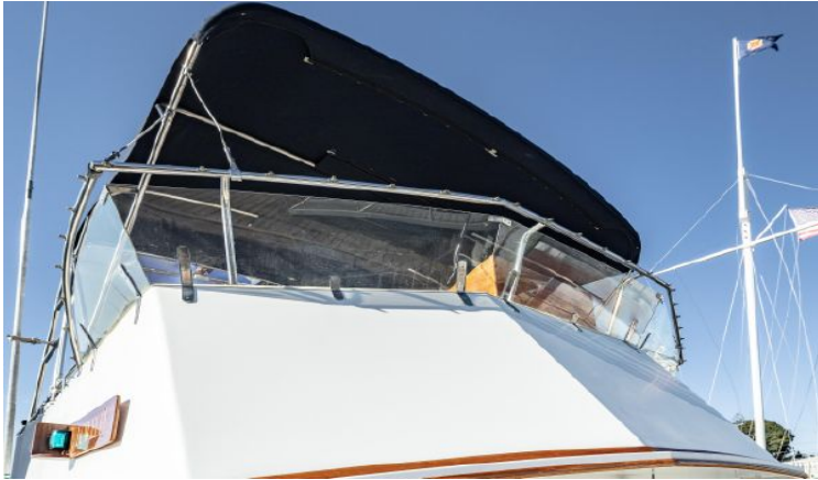
Venturi and New Bimini