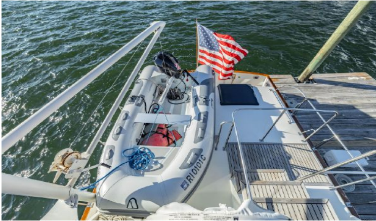
Dinghy and Convenient Dinghy Davit