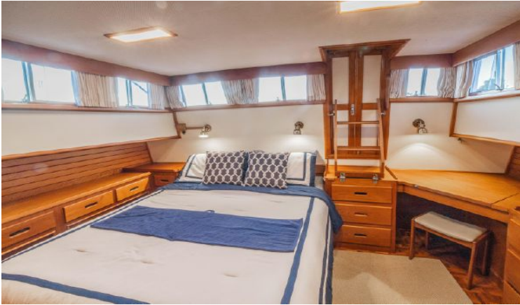
Superb, Bright Master Suite, Extensive Built-in Drawers