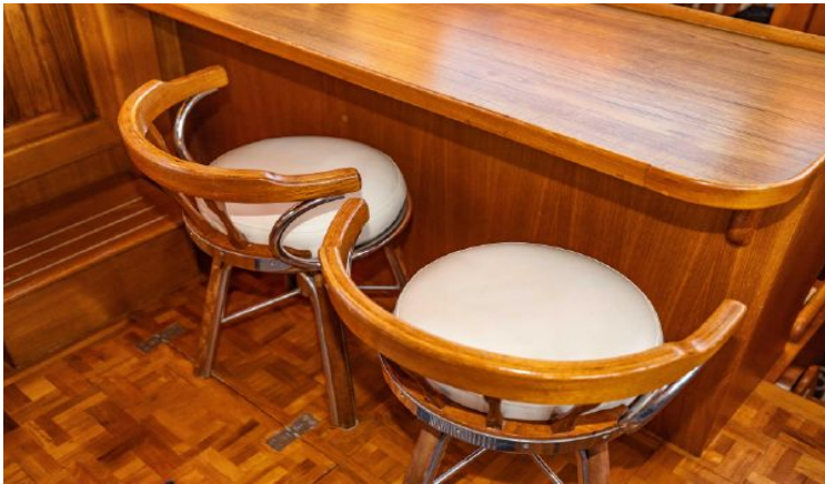
Large Breakfast Bar and Lower Chart Table