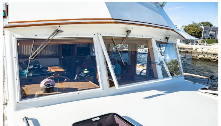
Center Opening Windshield