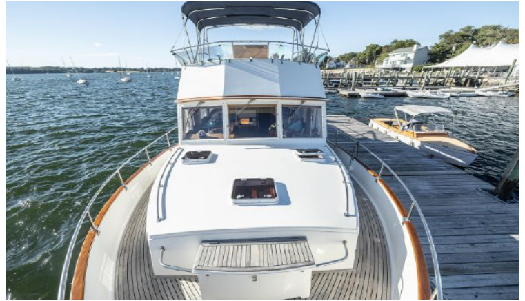
Foredeck and Flybridge