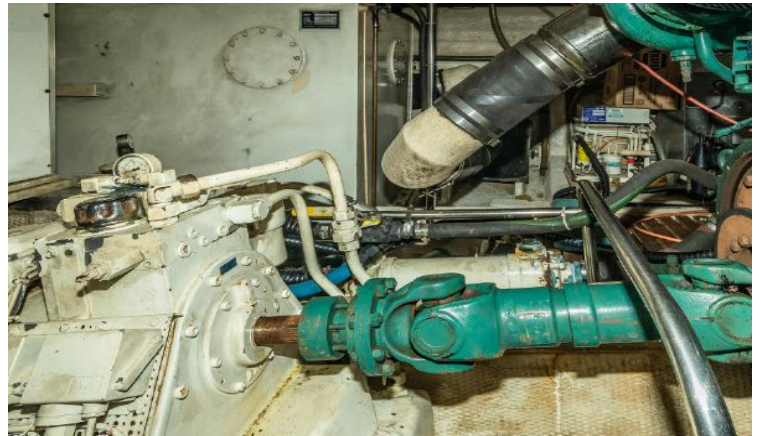
Hundested Drive, Shaft w/Twin UJ. No need to Align!