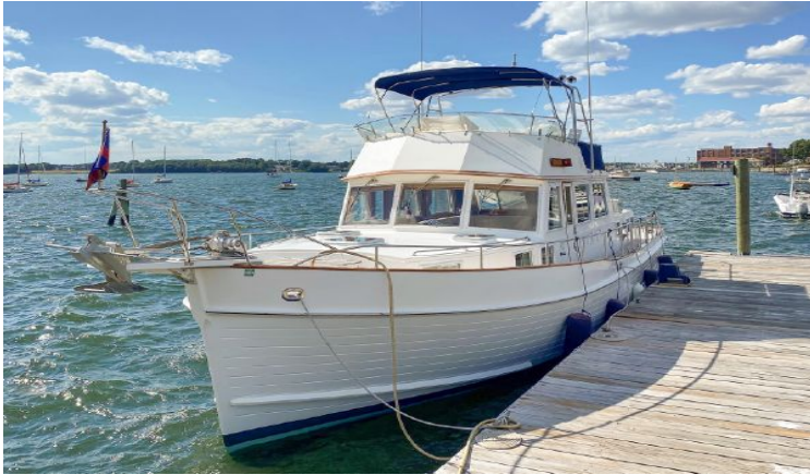
Fine Entry and Classic Sheer