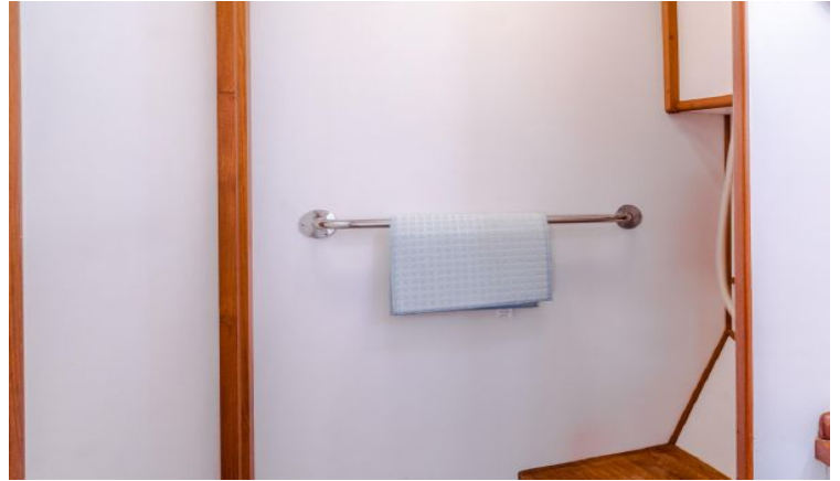
Large Enclosed Guest Shower