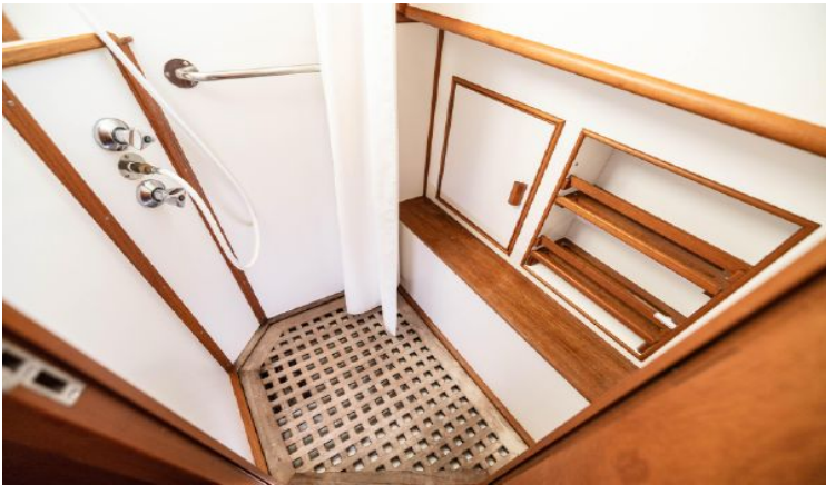
Large Separate Full-Size Master Shower