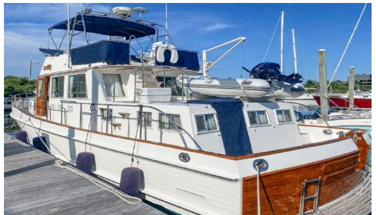
Ready For A Great Cruise!