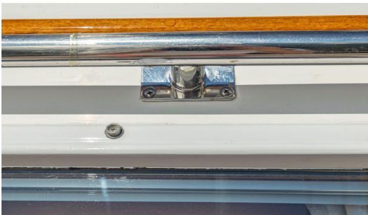
Perfect Window Frames, Rails and Brightwork