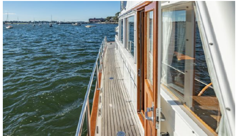
Wide, Safe Side Decks. Helm Door Open