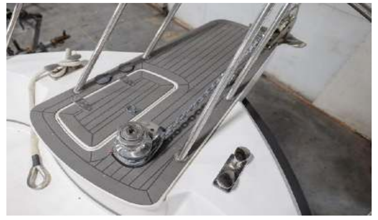
Large, safe pulpit, windlass