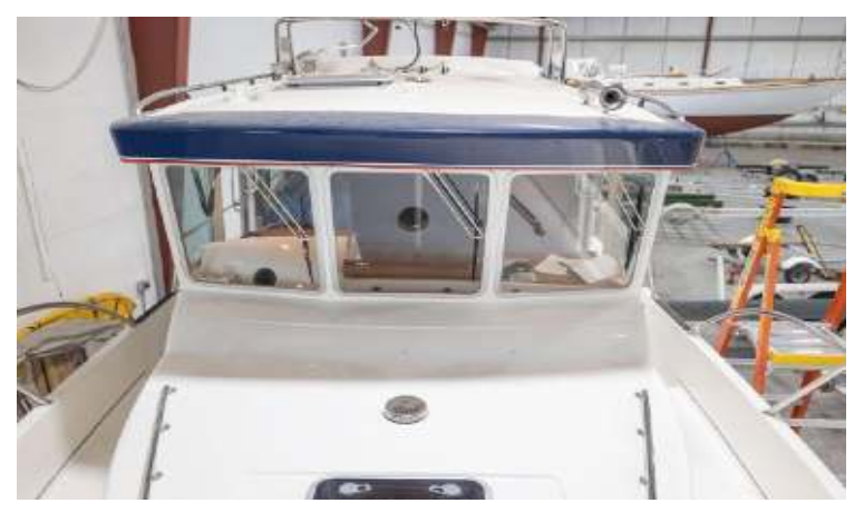
Forward raked windshield