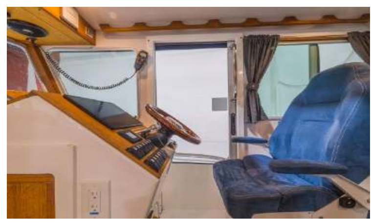
Large sliding doors port and starboard