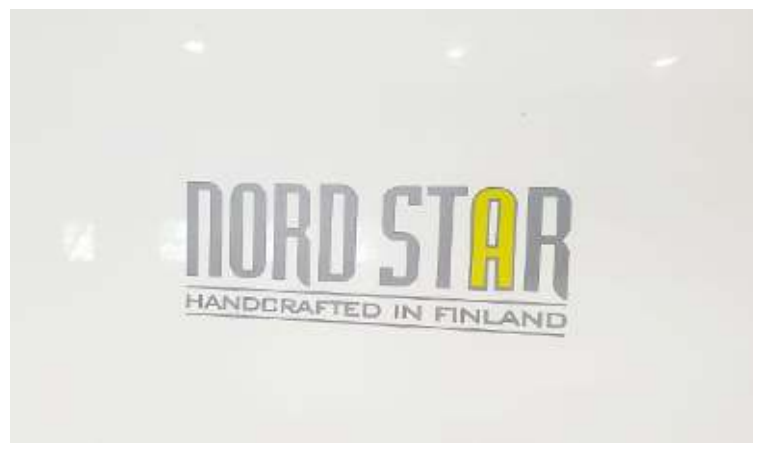
Proud family business