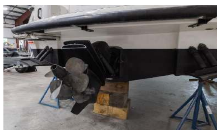
Annually serviced Volvo drive