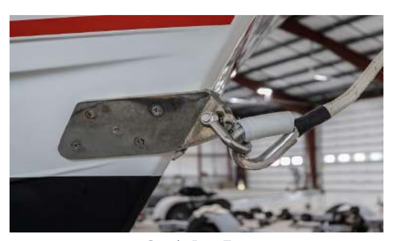
Sturdy Bow Eye