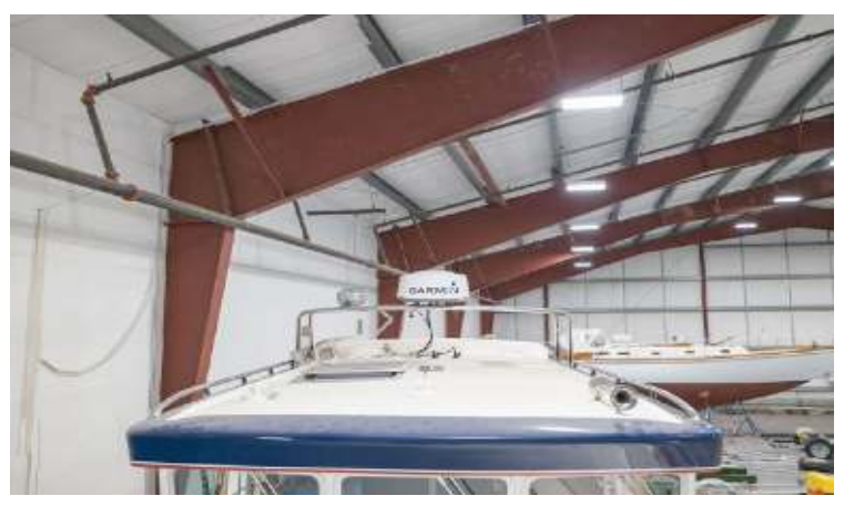
Roof, radar arch and antennas