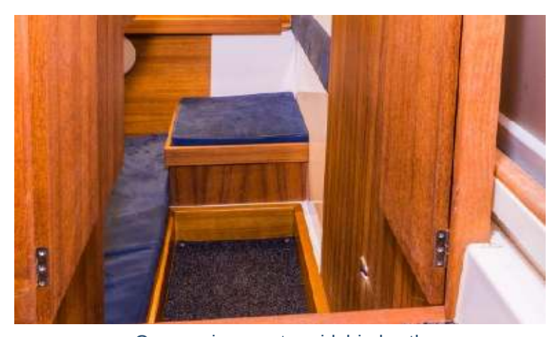
Companionway to midship berth