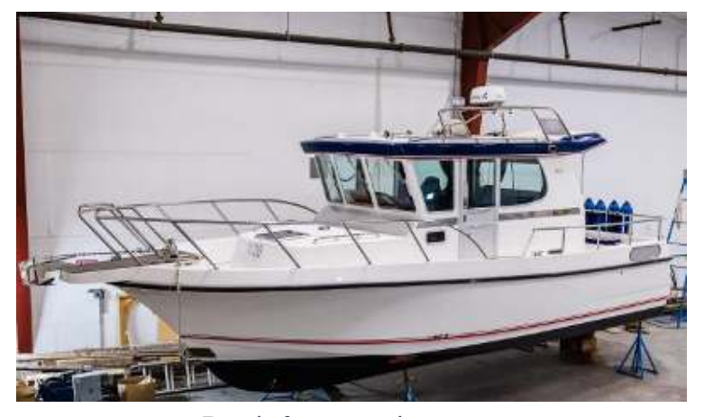
Ready for new adventures