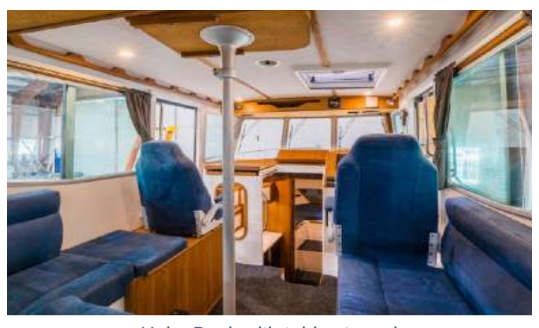
Helm Deck with table stowed