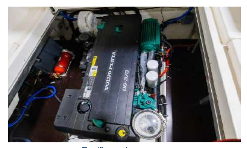
Terrific engine access