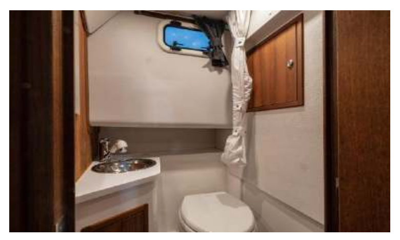
Head and Shower