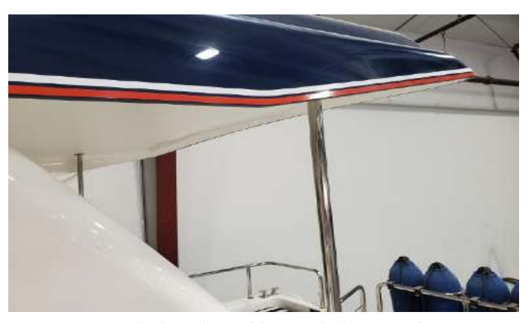
Extended roof provides cockpit protection