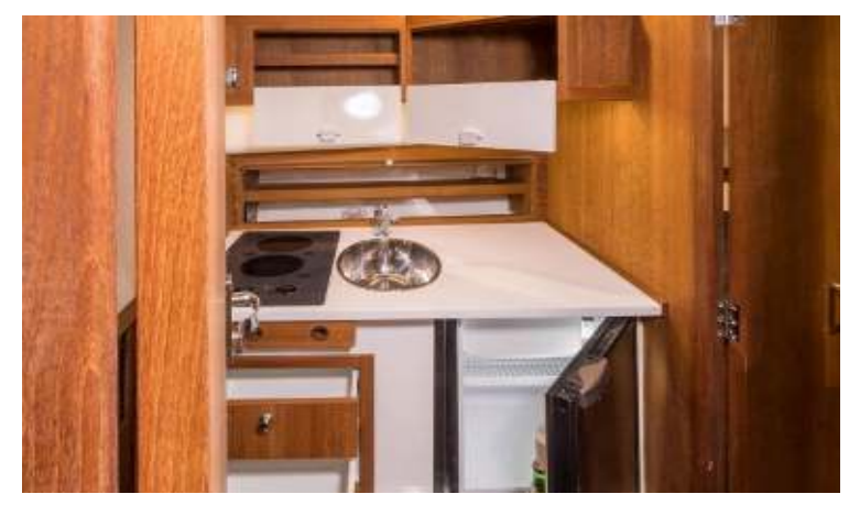
Galley will all storage spaces and fridge open