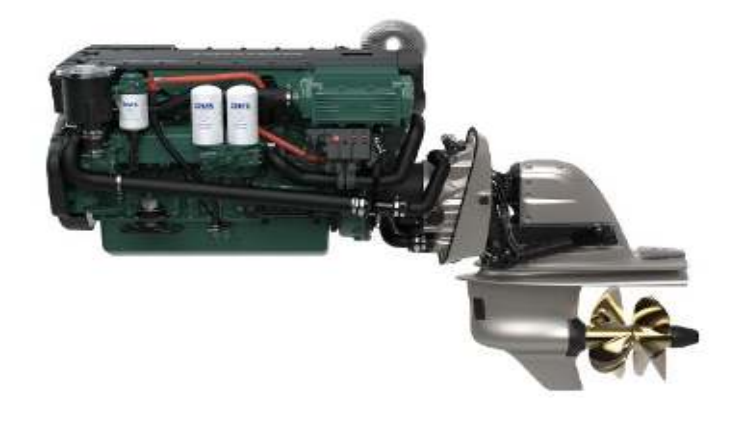
Volvo Penta D6-370 DPH