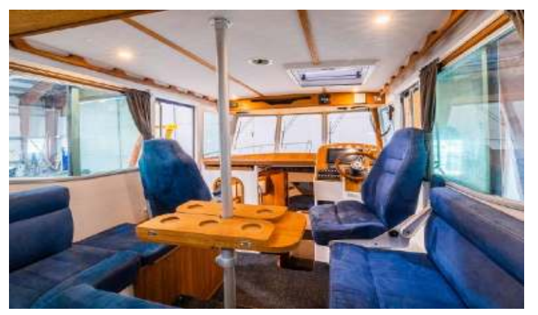
Helm deck with table lowered and Helm seat rotated