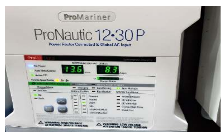
Advanced technology battery charger