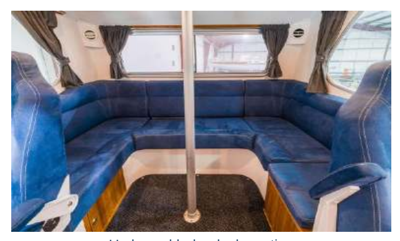
U-shaped helm deck seating