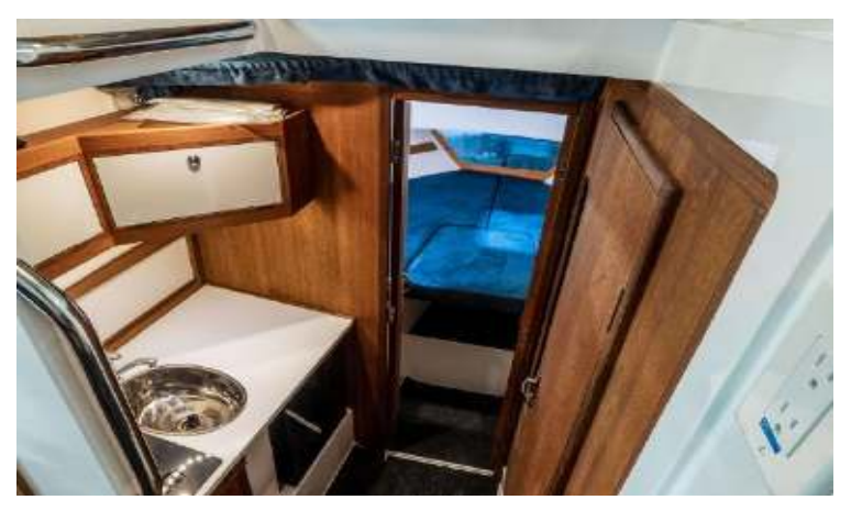
Galley and Forward Berth